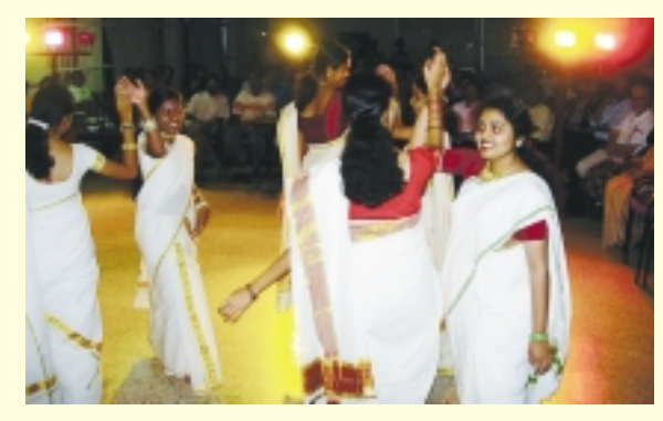
From the cultural evening staged by students