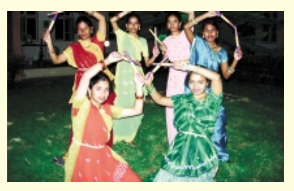
From the cultural evening staged by students