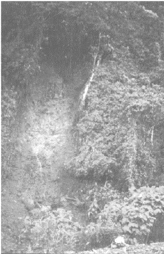
Fig. 3.16 Flujo de detritos, Arancibia, Costa Rica (Foto R. Mora).