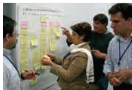
Training participants discussing Kaizen in the field of medical care (Quality Management in Health in Latin America, JICA Tohoku)

In the area of health and medical care, priorities are given to the reduction of infant mortality, maternal and child health and reproductive health for improvement of the health of pregnant women, infectious disease control targeting the poverty group, improvement of regional health including training for nurses, support for persons with disabilities, and supply of safe drinking water. In this area, as in the area of education, many experts and volunteers play active roles. The Project for the Vector Control of Chagas Disease implemented in Guatemala, Honduras, and El Salvador is a typical example. Chagas disease, which is common among the poor in rural areas, is a serious disease. Once it enters its chronic stage, there is no effective cure. JICA is bringing results, from supporting persistent activities to eradicating the dis-