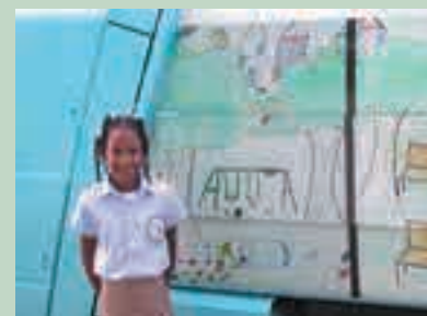
A garbage truck and the primary school pupil who drew the picture that adorns it