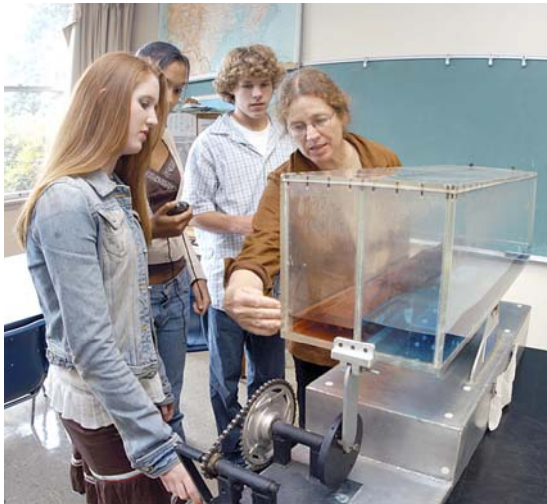
A scientist explaining tsunami waves to high school students.

Tsunami safety depends first and foremost on personal action. People who move quickly from the inundation zone move themselves to safety. Whether in response to feeling an earthquake or receiving a warning, safety comes from the personal decision to take appropriate action and thus depends on every citizen possibly at risk knowing how to respond appropriately. This knowledge must be conveyed to all our citizens for true safety to be achieved.