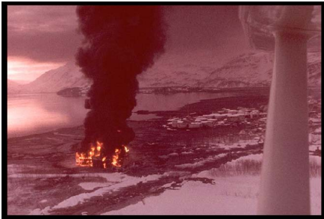
A fire triggered by the 1964 Alaskan tsunami in Valdez, AK.

U.S. Building codes generally have not addressed the subject of designing structures in tsunami zones. FEMA's Coastal Construction Manual (FEMA 55), developed to provide design and construction guidance for structures built in coastal areas, addresses seismic loads for coastal structures and provides information on tsunami and associated loads. However, the authors of the Coastal Construction Manual concluded that tsunami loads are far too great and that, in general, it is not feasible or practical to design "normal" structures to withstand these loads. It was acknowledged that special design and construction details would be possible for critical facilities.