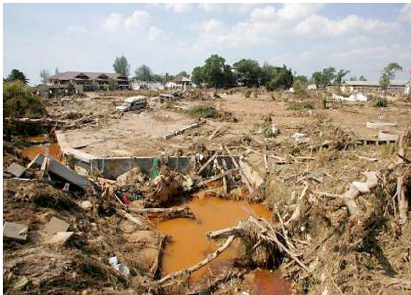
Damage at a tourist beach from the 2004 Sumatran tsunami.

The 2004 great Sumatran earthquake occurred on a fault that extends over 1200 kilometers (800 miles) off the coast northern Sumatra. The earthquake triggered a giant tsunami that propagated throughout the Indian Ocean Basin, causing massive casualties, extreme inundation, and destruction along the northern and western coast of Sumatra. Within hours, the tsunami devastated the shores of Thailand to the east as well as Sri Lanka, India and the Maldives to the west. The tsunami also caused deaths and destruction in Somalia and other nations of east Africa. The propagation of the tsunami was worldwide so that it was even detected on the California coast.