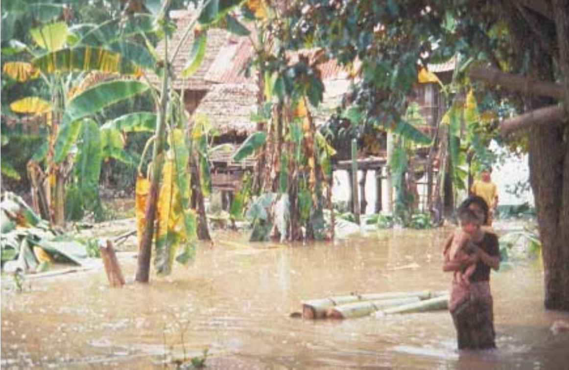
Future global warming may lead to fewer and less intense El Niño events. (Andrus, 2002)

also reports there has been a decrease in the annual number of thunderstorms with hail over the period of record, and there has been a decrease in the frequency of storms producing precipitation greater than 20 mm.