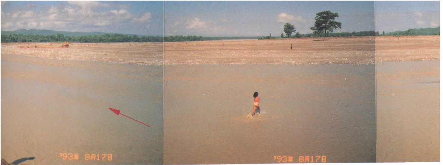
ere the village situated at an island was completely swept.