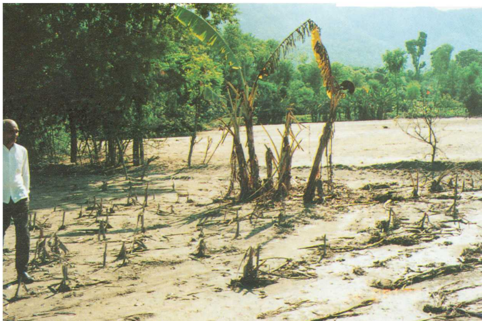
There was a irrigation canal which was completely destroyed.