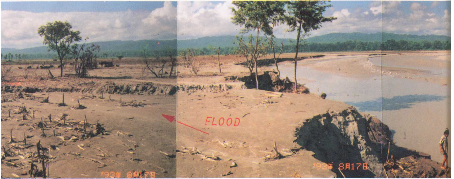
Manahari River at the confluence with East Rapti River w