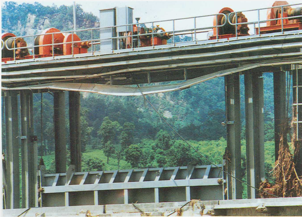
Wooden logs trapped in the regulating gate of Bagmati Barrage.