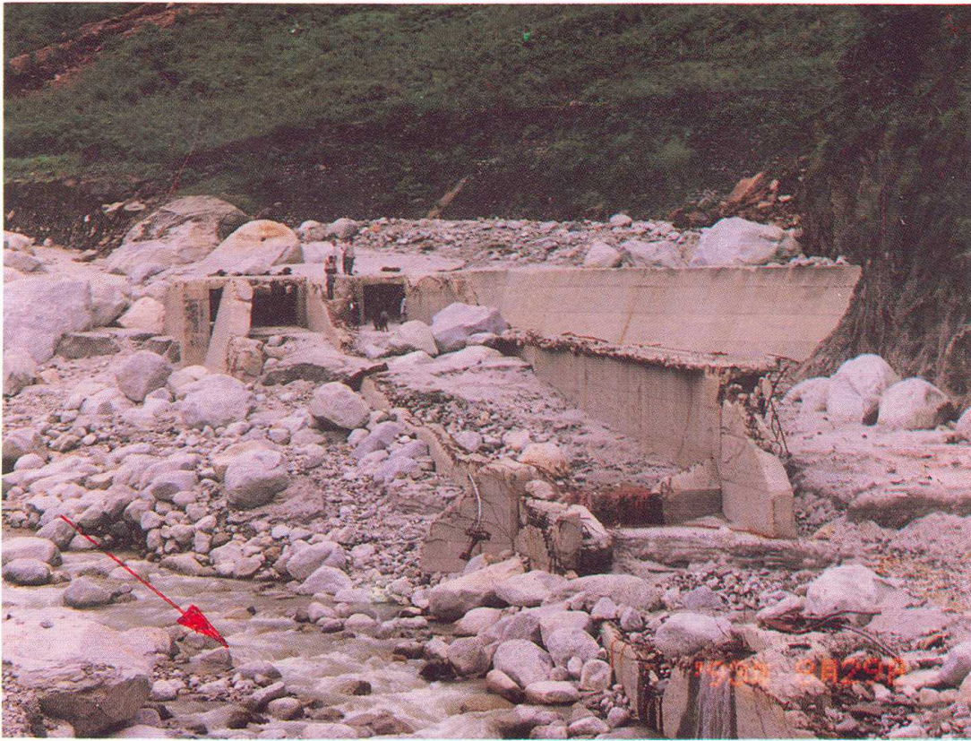
Damage to intake of Kulekhani No. II Power Station at Mandu Khola by debris flow.