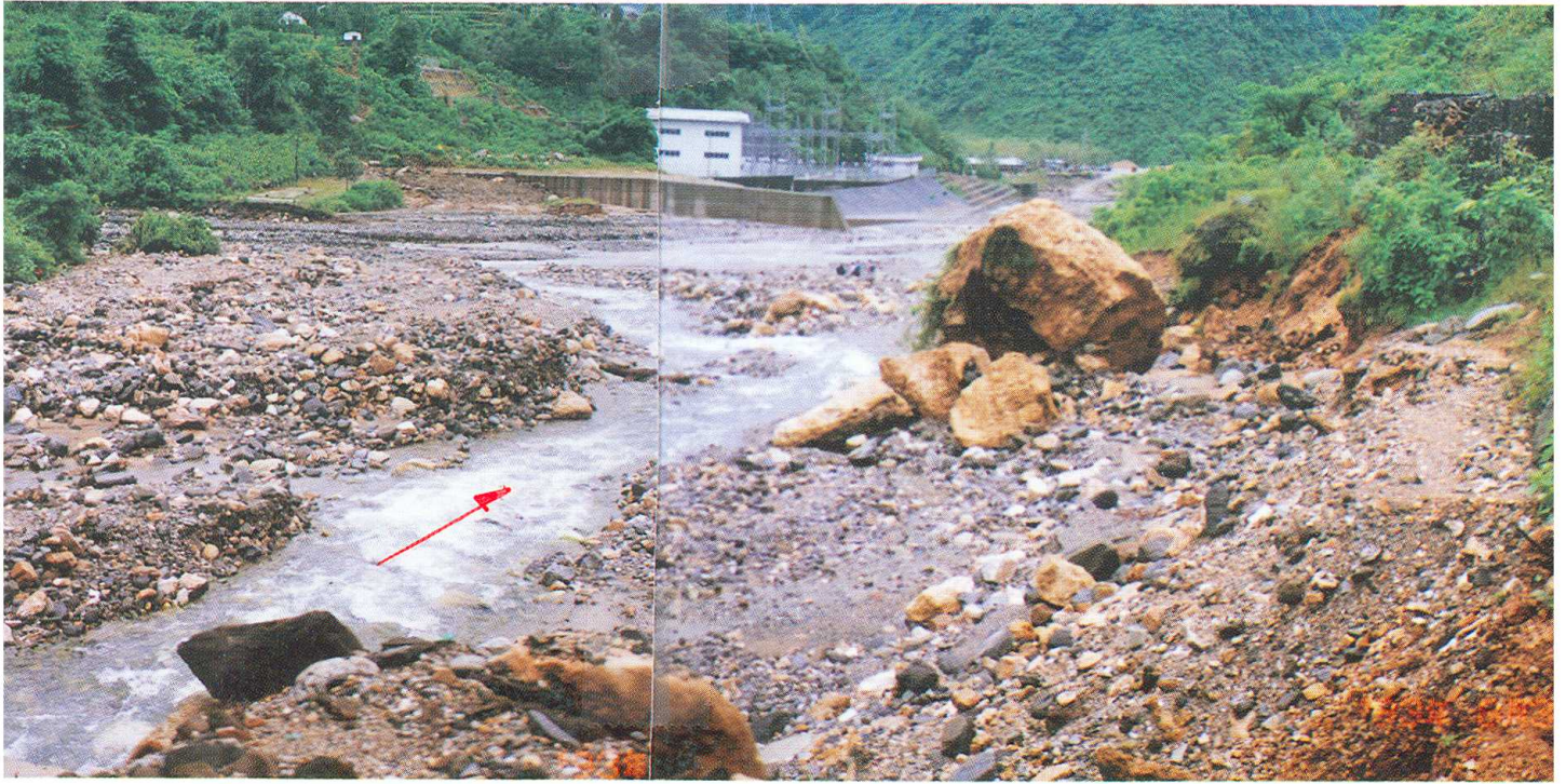
Debris deposition on the bank of Khani Khola in the upstream of Kulekhani II Power House.