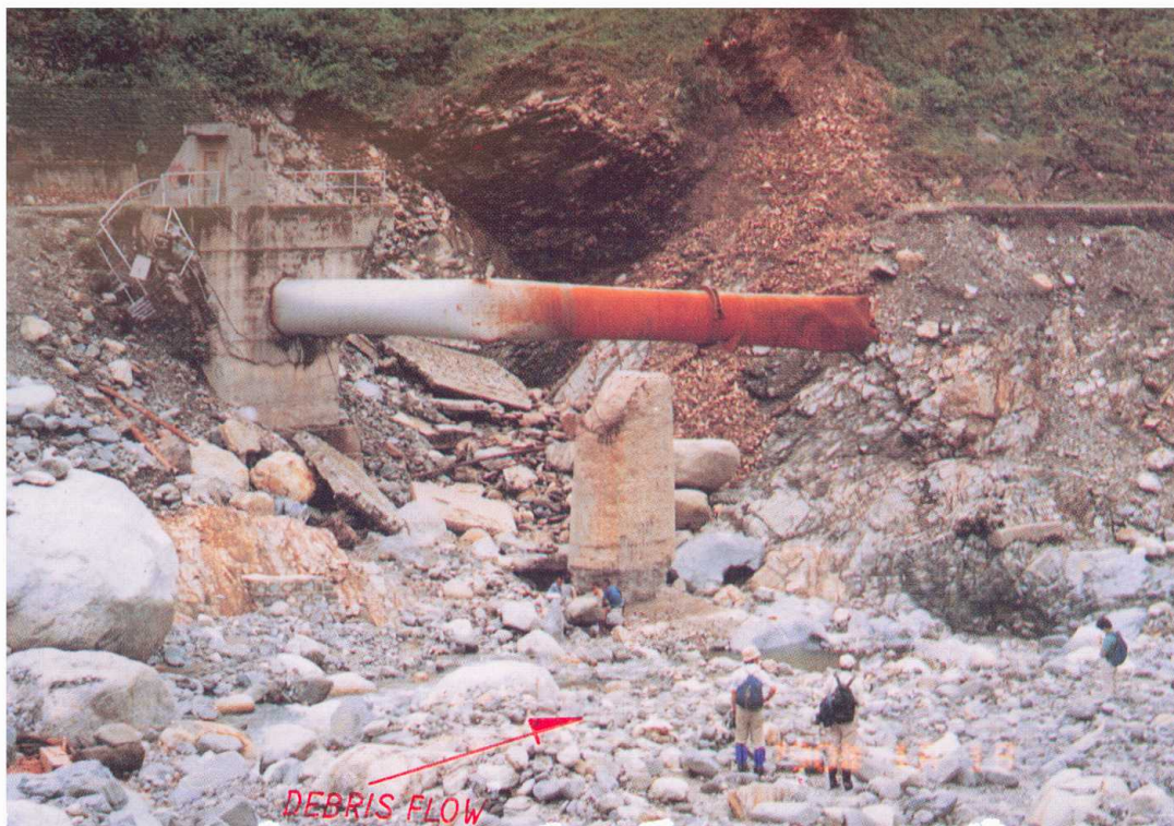
About 100 m long penstock pipe was damaged by debris flow at Jurikhet. Upper portion of the pier has been cut off by abrasive action of debris flow.