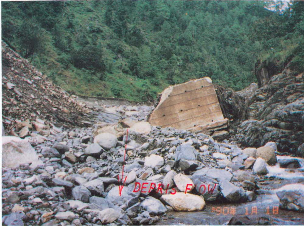
A collapsed check dam in Jurikhet Khola