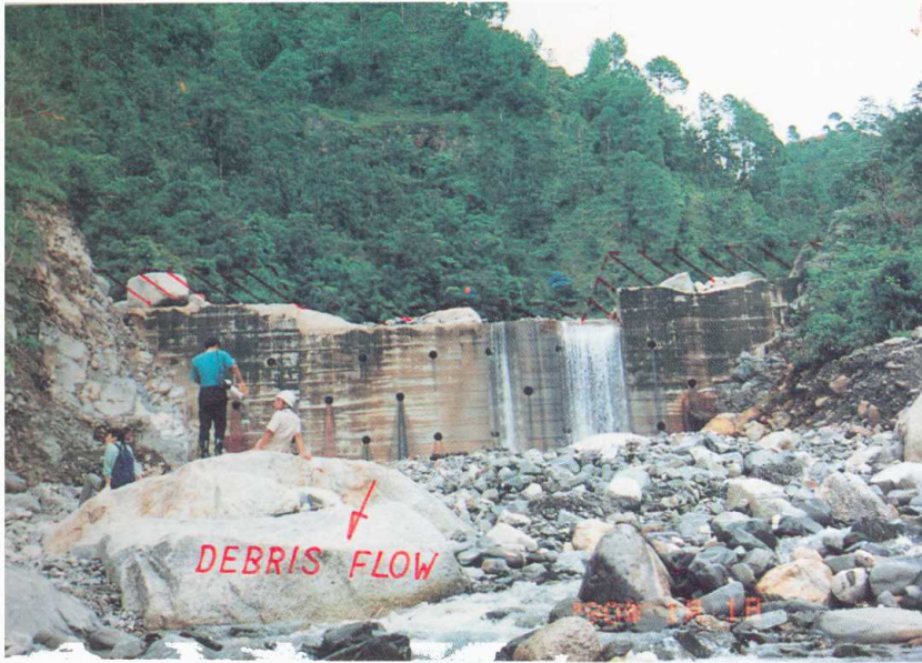
Damage to check dams of Jurikhet Khola by debris flow.