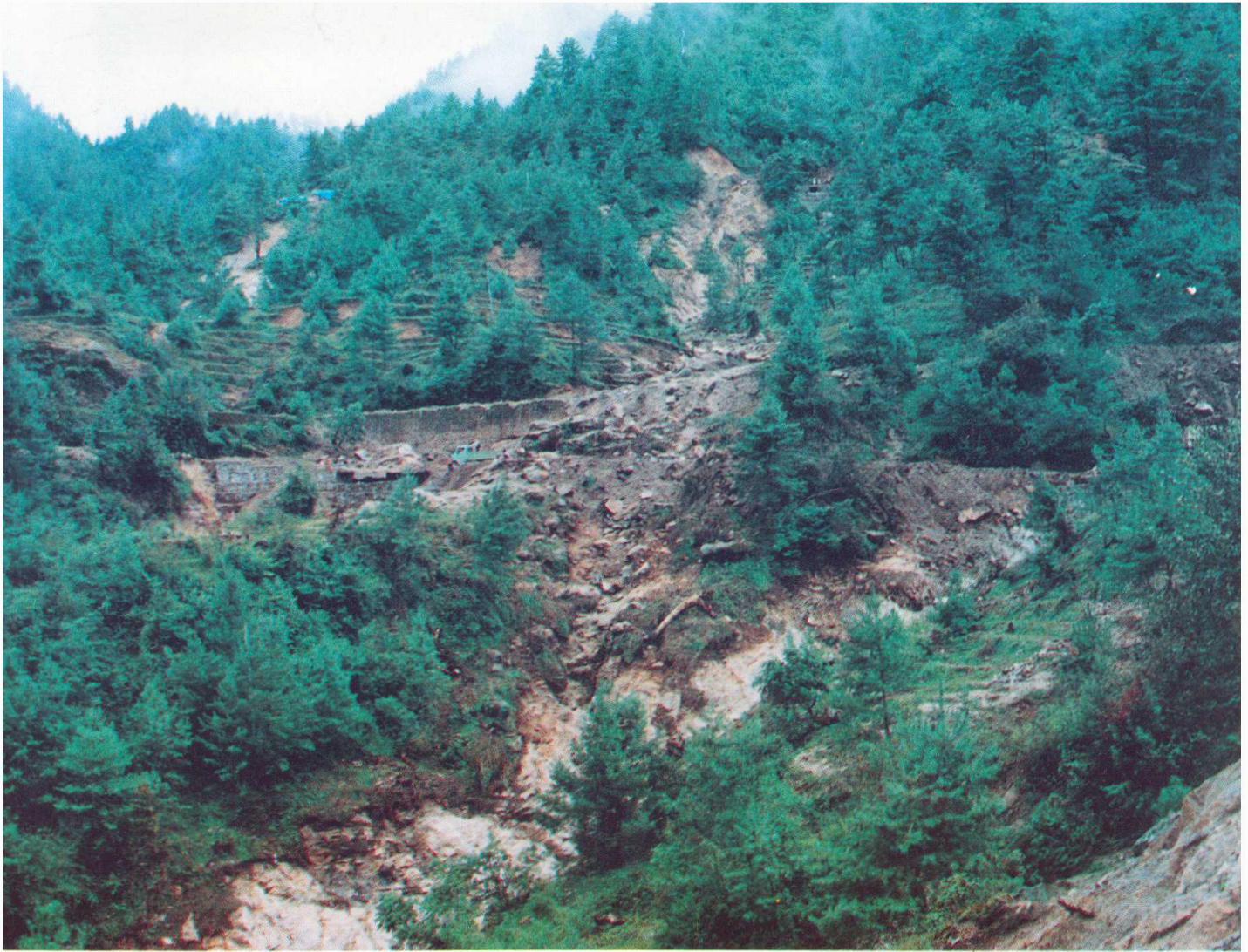
Section of Tribhuvan Highway damaged by debris flow near Palung