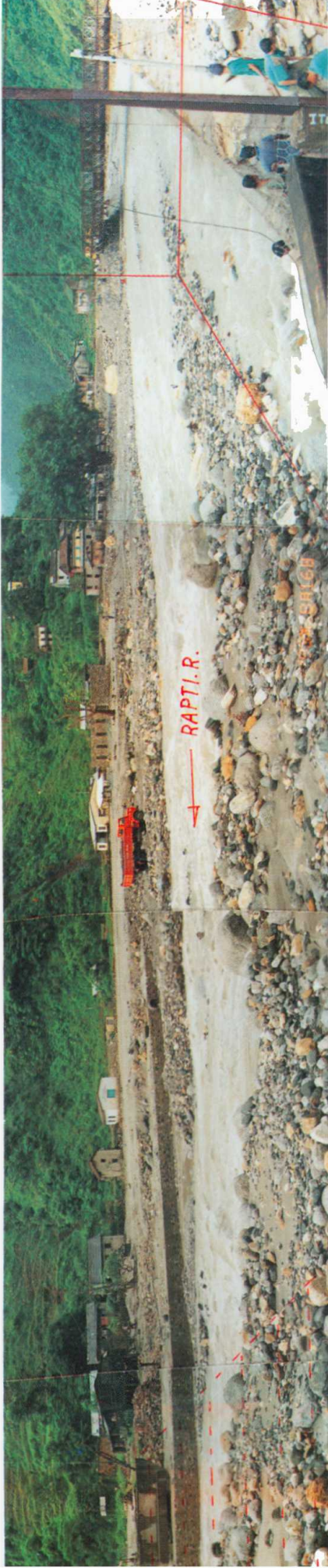
Huge debris flow at East Rapti River destroyed Highway Bridge of Bhainse (L = 61 m) completely. Newly erected Bailey Bridge (L=37m) is seen at the extreme right.