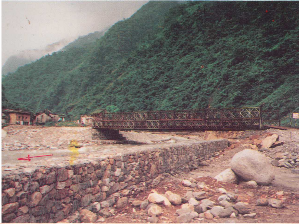
Slope failures and gulley erosion near Tistung.