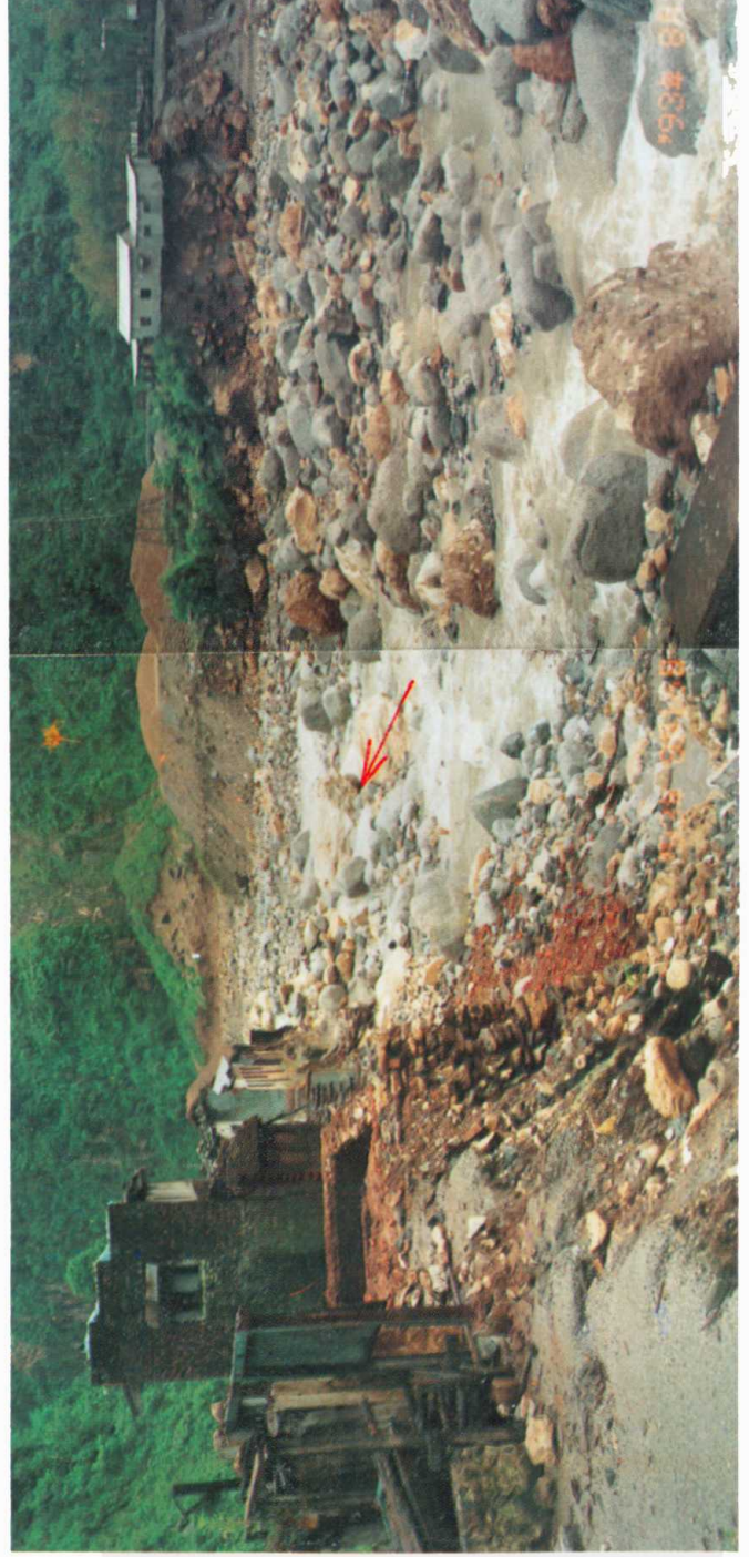
Damage to houses situated at Bhainse by debris flow of East Rapti River.