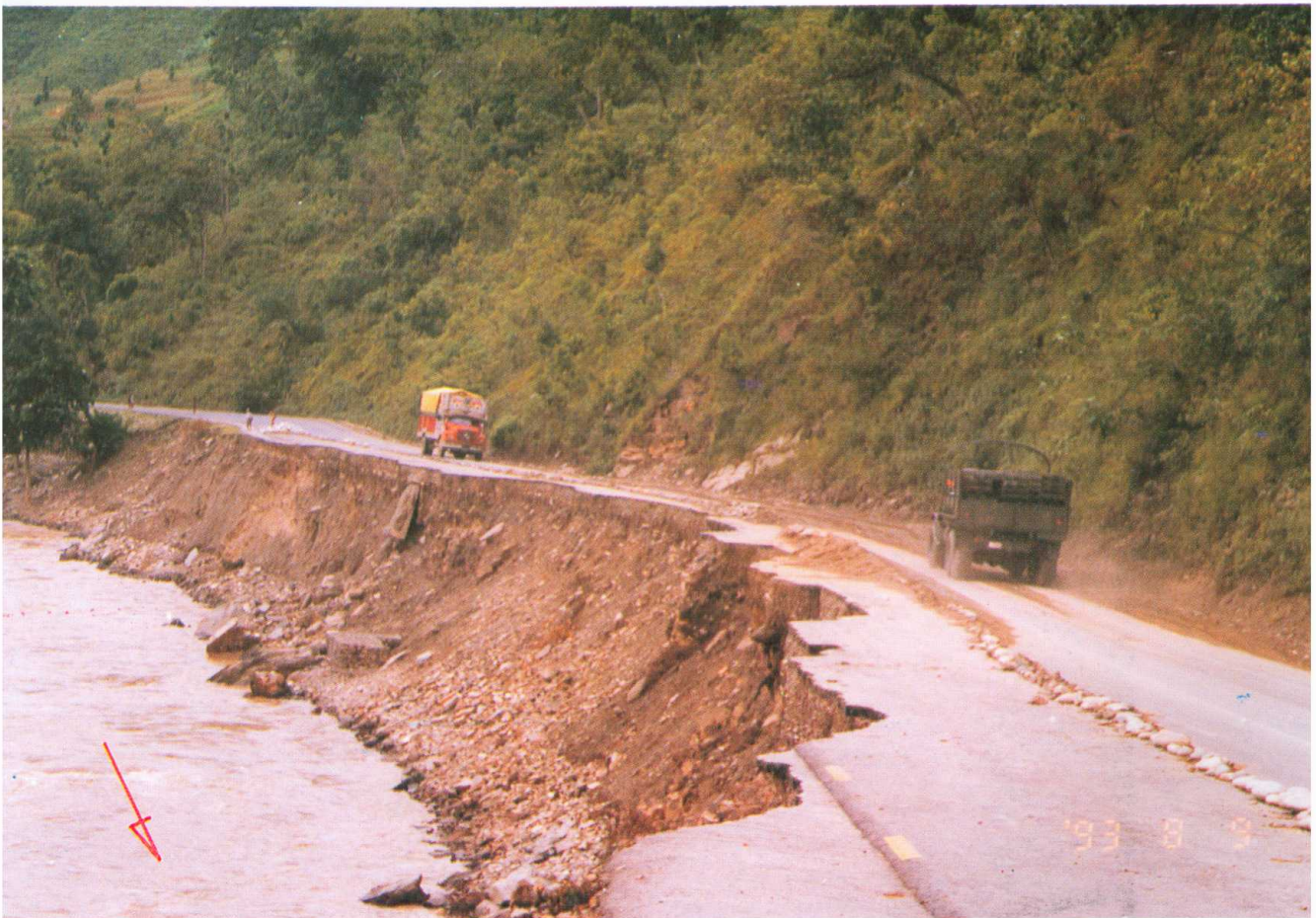
Damage to Prithvi Highway at downhillside due to bank cutting by Trisuli River.