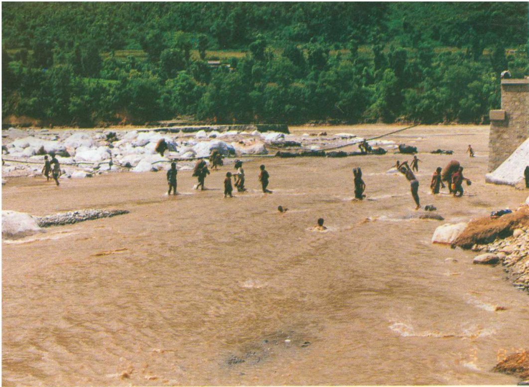
Passengers crossing Belkhu Khola in the absence of Bridge.