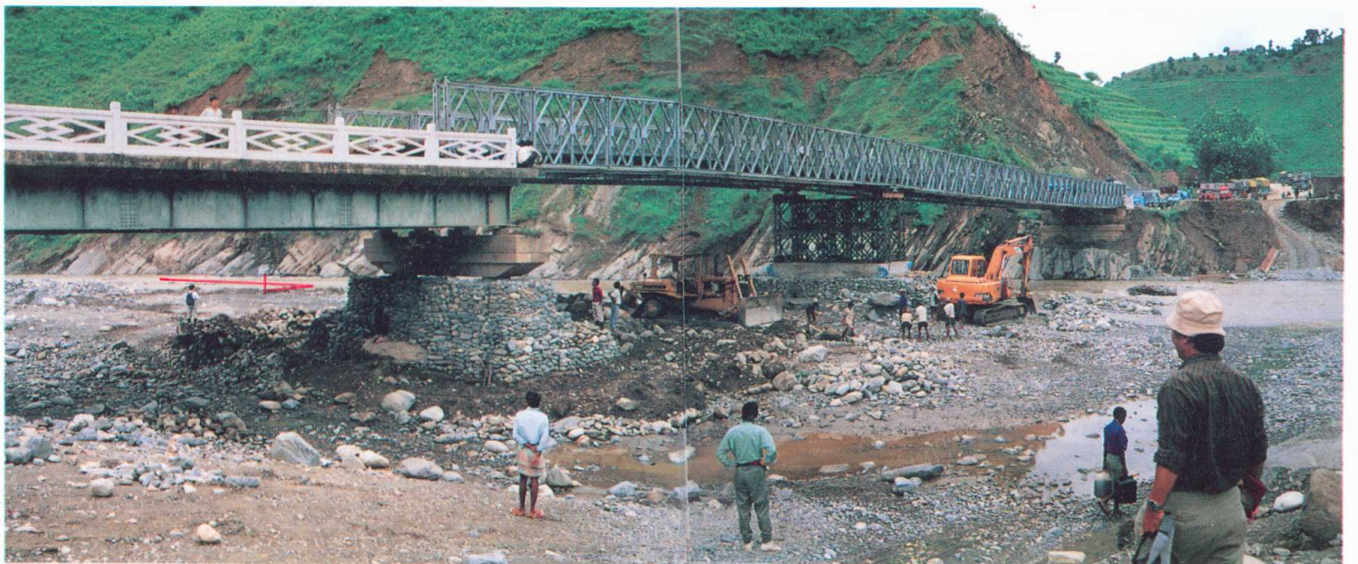
Newly established Bailey Bridge over Agra Khola at Mahadevbesi.