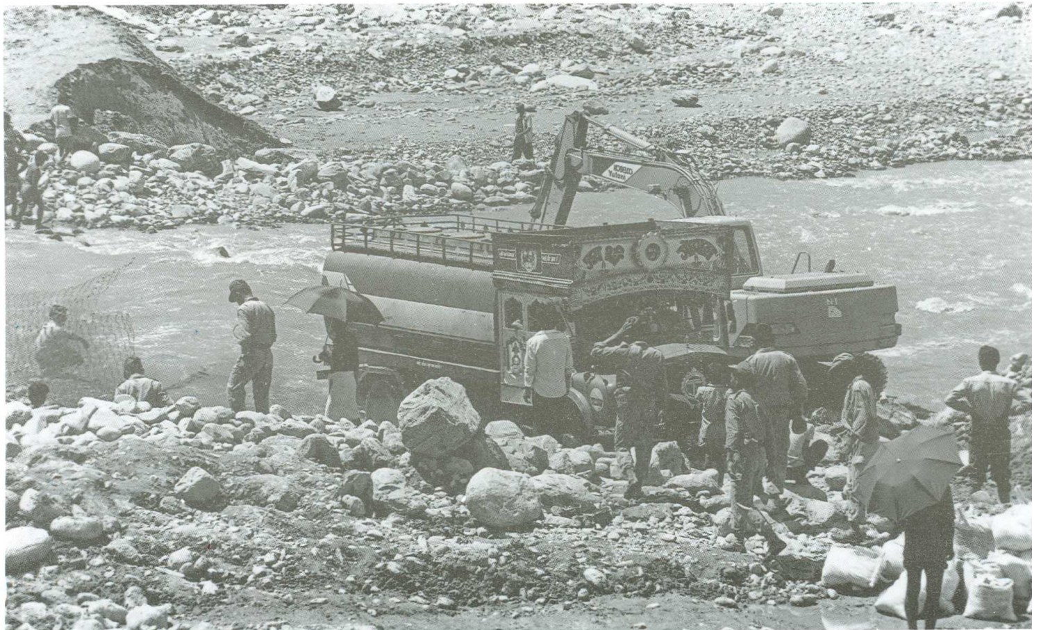
Oil tankers proceeding towards Kathmandu across Agra Khola at Mahadevbesi.