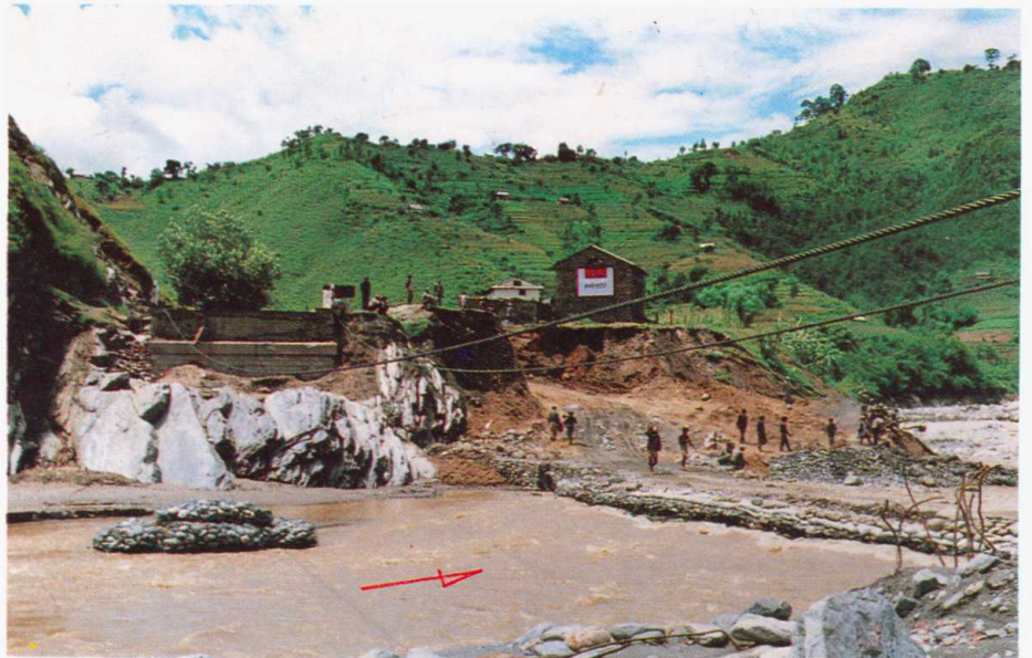
Temporary cable crossing at Mahadevbesi

Prithivi Highway was seriously damaged between Naubise and Mugling (L = 84 km): Three major bridges of Mahadevbesi, Belkhu and Malekhu were destroyed; Road was heavily eroded by flood of Trishuli river at many locations; Major landslides took place to block the traffic in Jogimara.