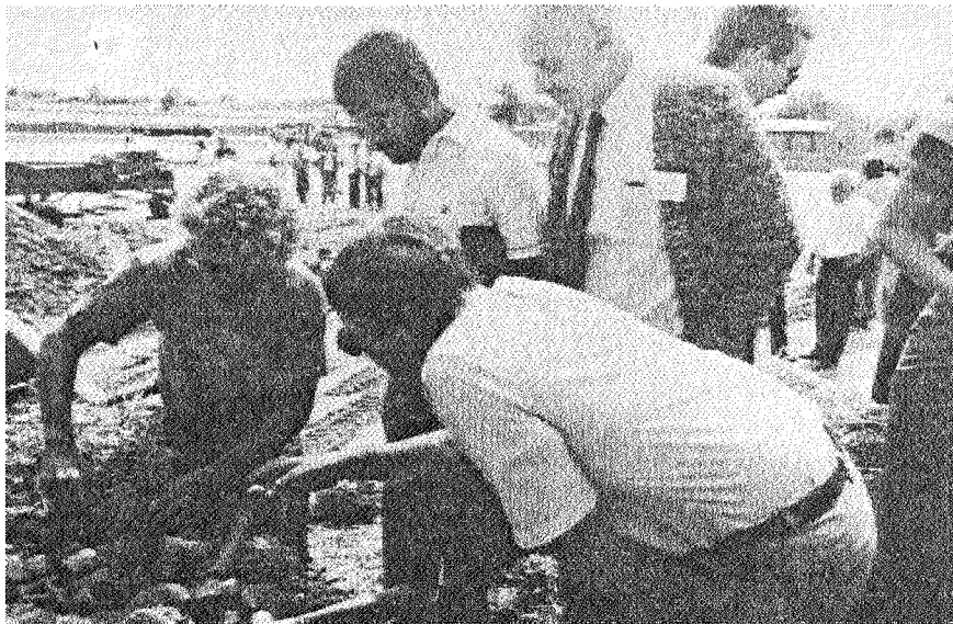
Figure 11. Mixing in the straw at the adobe yard.