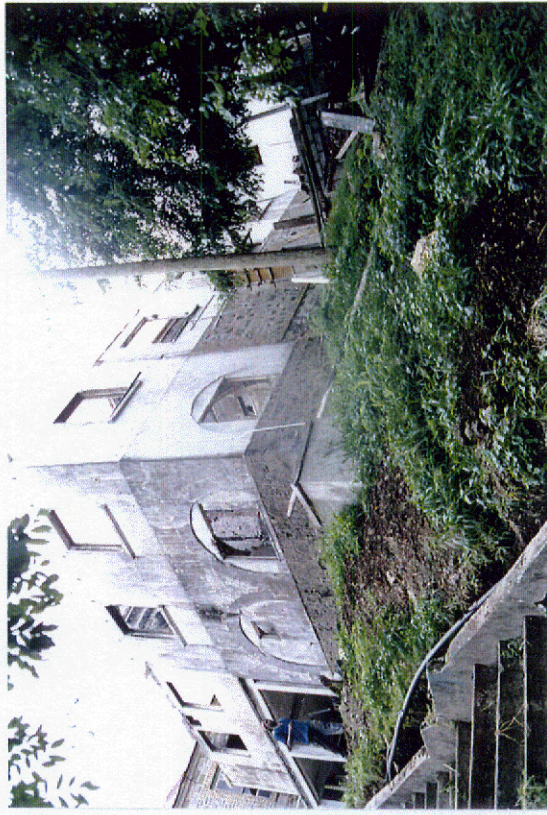
Photo 35: View of NE corner of L-Block. New construction is on the far right.