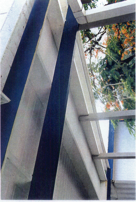
Photo 11: Verandah roof on (temporary) ward #6. All timbers are nailed. No hurricane clips or other fixings are present.