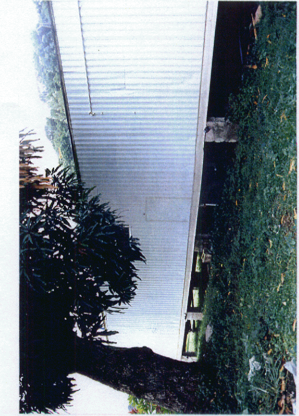
Photo 10: Close up of temporary facilities. There are no positive fixings holding the superstructure to the foundations.