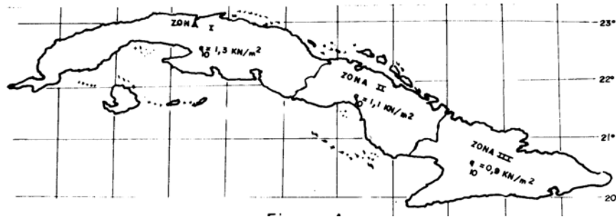
Regionalization according to the basic pressures of the wind.