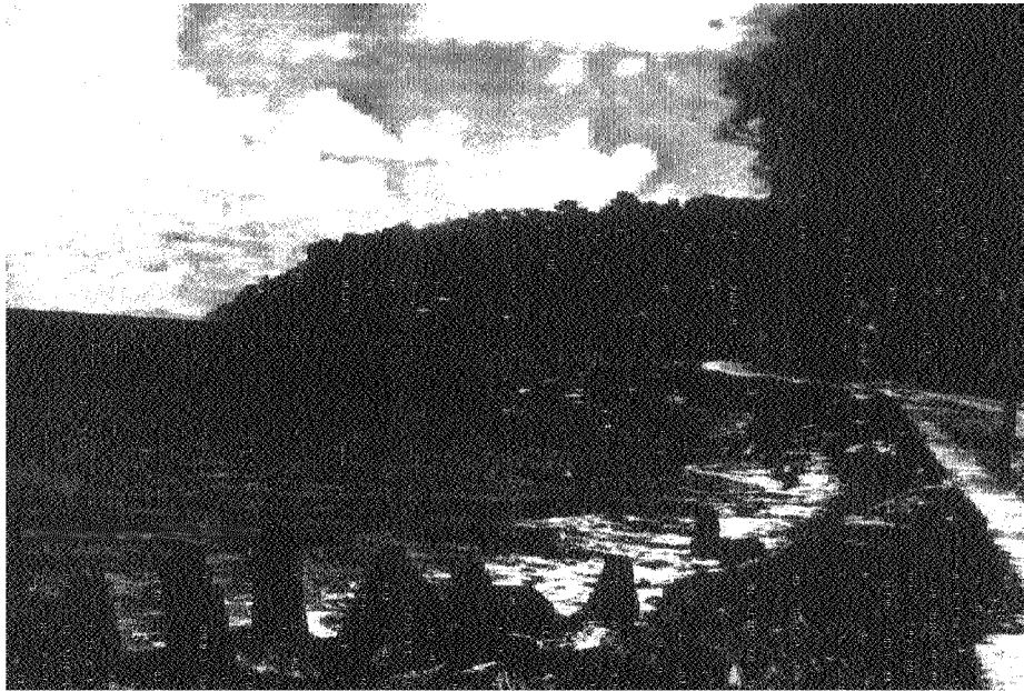
Lack of maintenance. Sea wall too low.